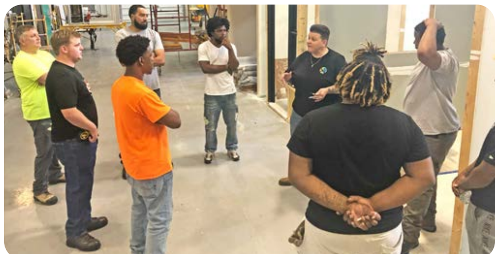
Miami Valley Building Futures Pre-Apprentices.