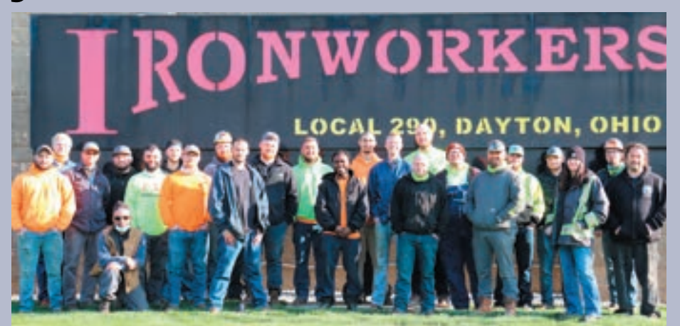
Iron Workers Local 290 JATC Class of 2021 graduates.