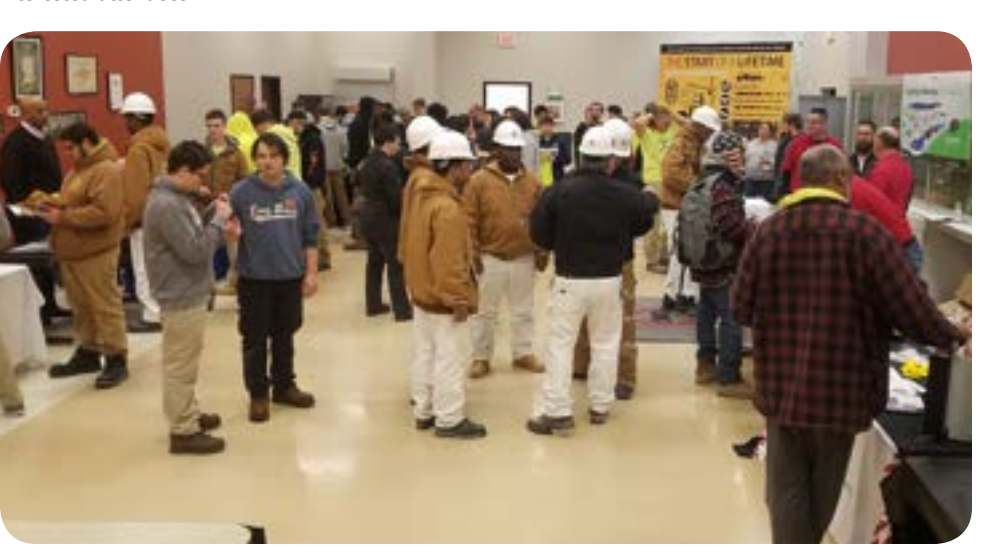
Job Corp students and other attendees engaged in great conversation with our signatory contractors during the Cincinnati Showcase March 8.