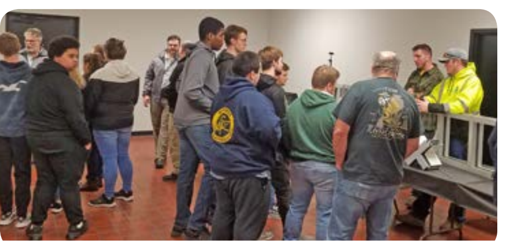
Glazier apprentices from Interstate Commercial Glass and More lead the reigns at the Glazing exhibit at the Toledo Showcase March 15. They took the initiative to explain the storefront installation process to interested attendees.

See PAINTERS AND ALLIED TRADES on page 25.