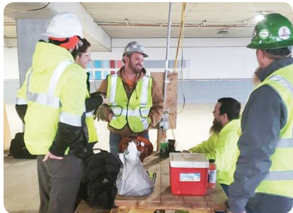
Cincinnati Business Representatives surprised IUPAT workers on the MEDPLACE job with a pizza lunch at the end of January.