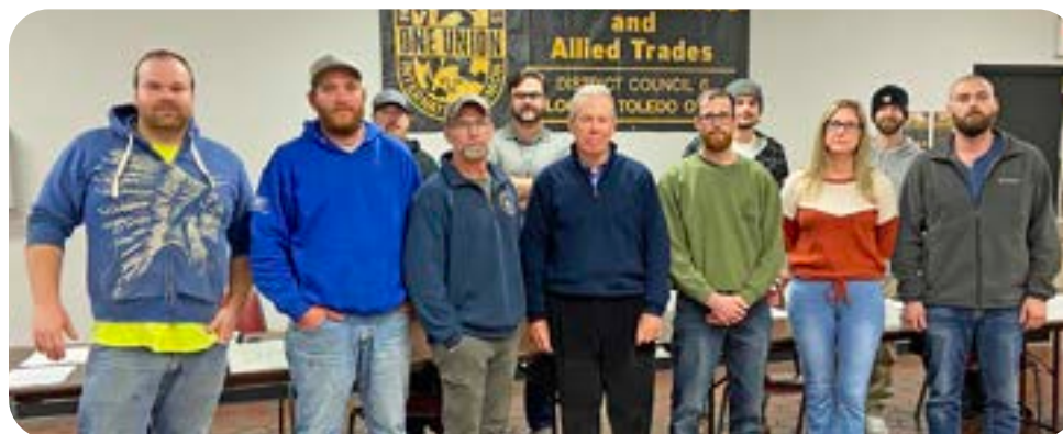
National Enclosure Company's current and future field and shop leaders attended a two-day course on supervisor training in Toledo.

Also, we will be collecting our yearly dues of $30 in March this year. A little bit earlier than past years.