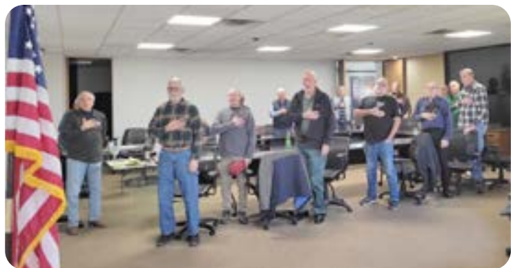
The Retirees' Club kicked off their March meeting with the Pledge of Allegiance.