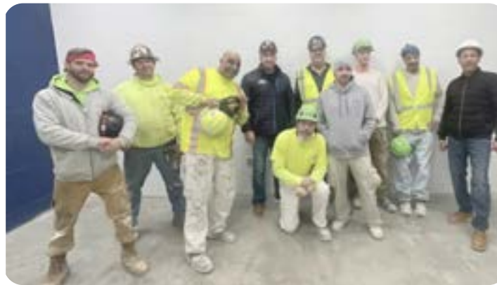
District Council 6 members and their respective Business Agents enjoy a pizza lunch at Warrensville Heights High School.